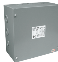
PSH500A Shown With Cover