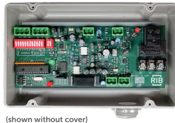
(shown without cover)

Temperature Input Analog Input (Thermistor)